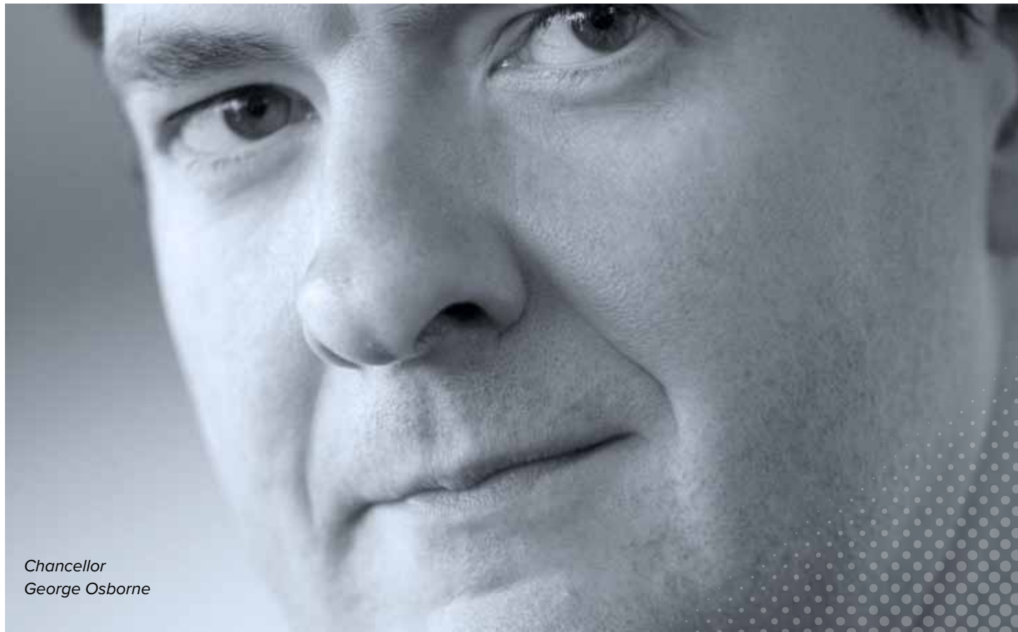
Chancellor George Osborne