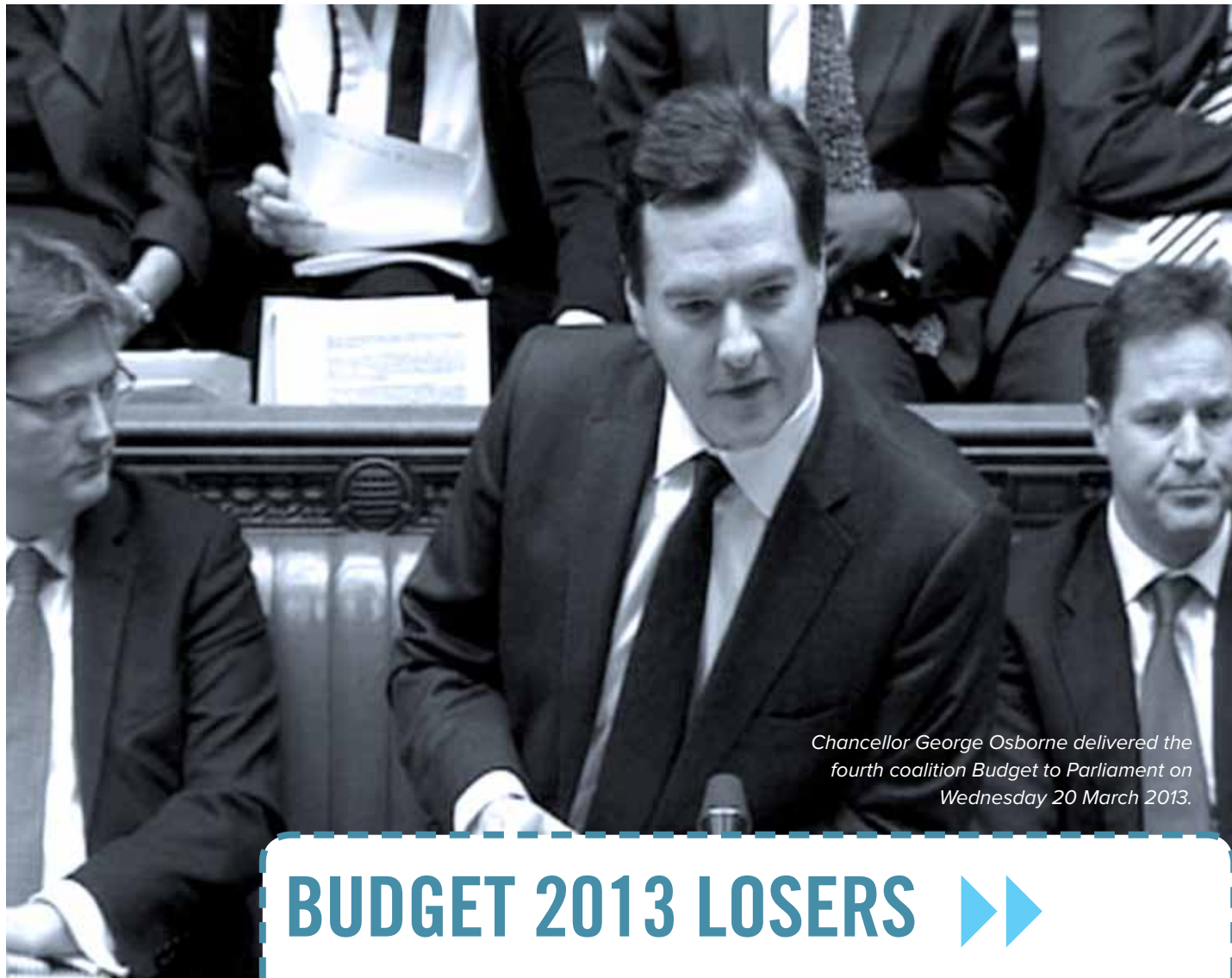
Chancellor George Osborne delivered the fourth coalition Budget to Parliament on Wednesday 20 March 2013.